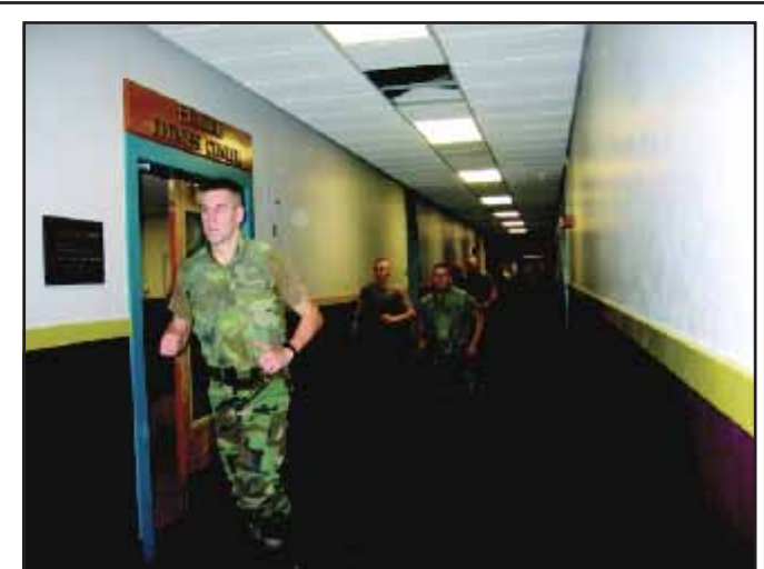
A Semper Fi Society pledge goes through weekly training sessions.

"The harder you push yourself, the faster it will be over," Kettner said. "This will really be a day of fun."